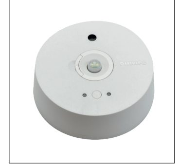
MCS wireless daylight&occ sensor