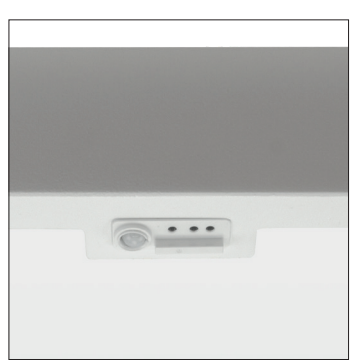
XC daylight&occ sensor

All current index numbers, lumen outputs, power consumption and many other technical information are available in our 2024 pricelist. Details on wireless lighting control systems on page number 896.