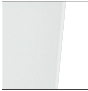
OP opal diffusor