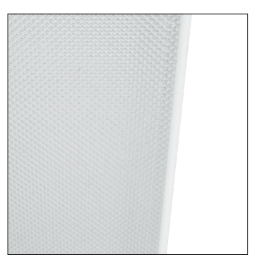
MP19H microprismatic diffusor